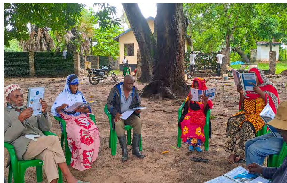
Updating outreach materials and training of additional STAs