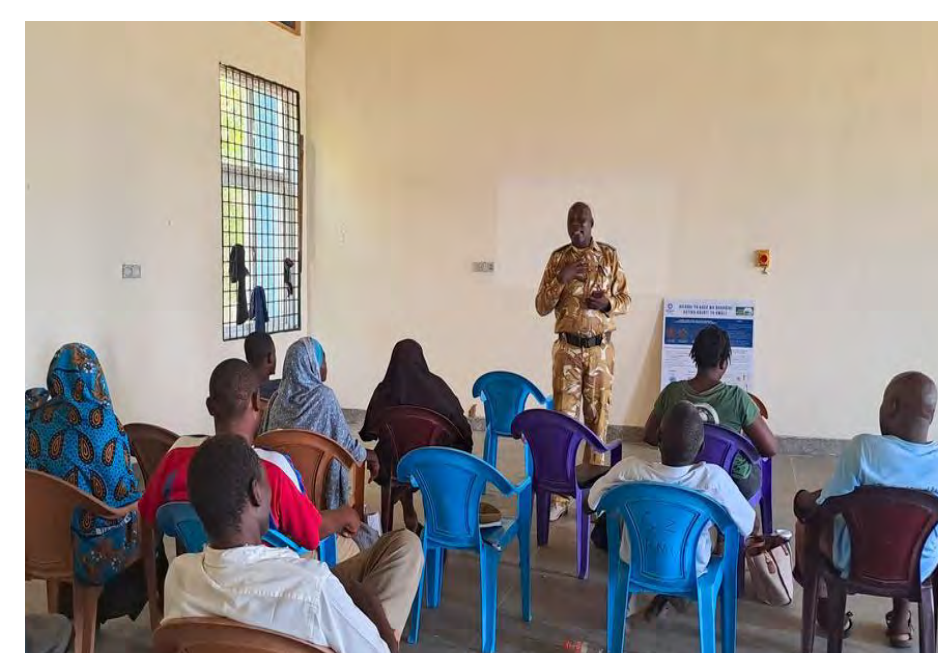
Participating in recap sessions