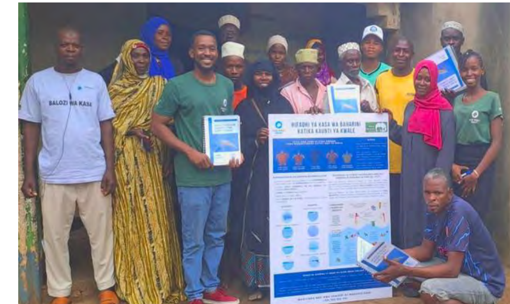
Participating in training workshops