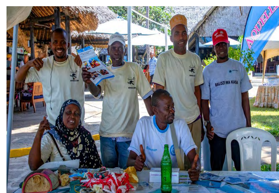
Participating in Diani Sea Turtle Festival