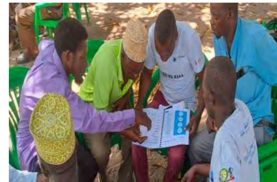
Conducting own outreach