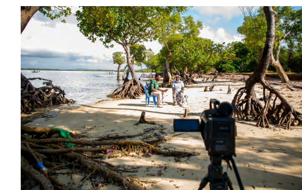
Engagement in storytelling and production of storytelling materials